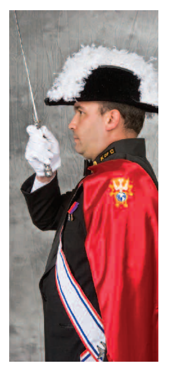
Figure 14 Figure 15 Figure 16