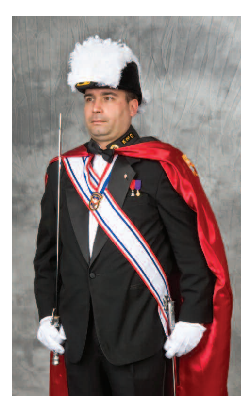
Figure 17 Figure 18