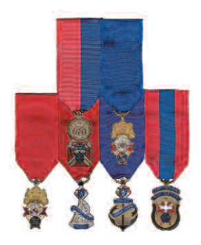
Diagram 6 Past State Deputy Former Vice Supreme Master Former District Master Former District Deputy Past Grand Knight Past Faithful Navigator