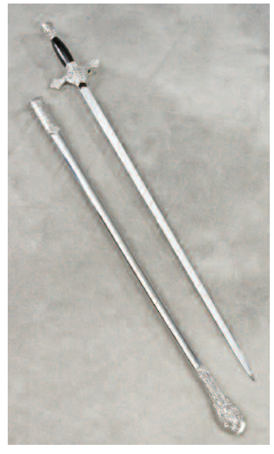
Black Handled Sword with Scabbard