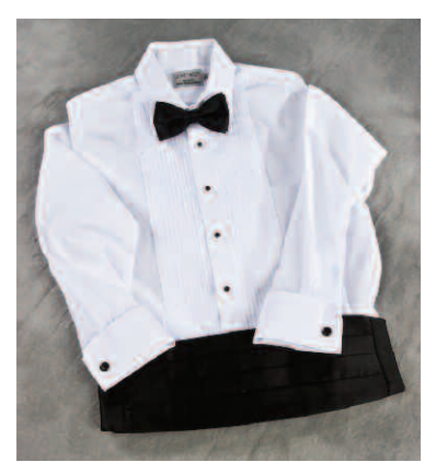
White Pleated Tuxedo Shirt with a Straight Collar With Studs and Cuff Links