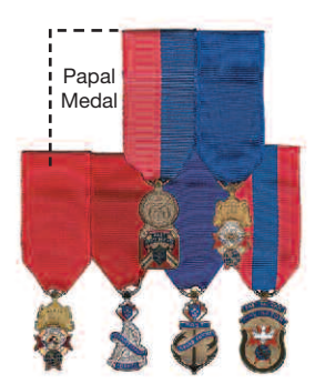
Papal Medal Past State Deputy Former Vice Supreme Master Former District Master Former District Deputy Past Grand Knight Past Faithful Navigator